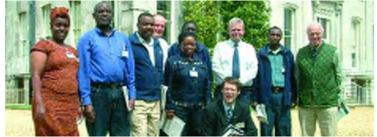
The 2007 Trainers at Kingston Maurward College, Dorset

This year we are working with six trainers who come from Malawi, Uganda, Kenya and Tanzania. We will also be working "in country" with six Tanzanian Training Institutes at the request of the Tanzanian Government, who will be funding the "in country" element of the programme, which indicates how much they value this support.